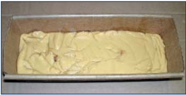
First, pour out a tray of caramel . . .