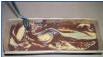
Set your artistic talents free . . . !