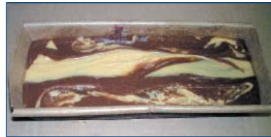
It should look like this!