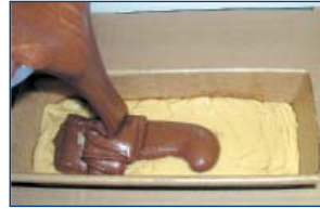
. . . before it sets cover it with chocolate.