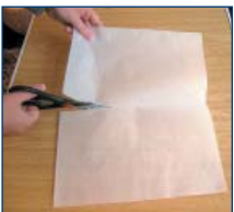
Cut paper in half down the short dimension

If you run out of liners for your fudge trays you can make your own very simply by cutting a sheet of siliconised baking parchment as shown in the pictures below. Be sure not to use greaseproof paper as it will stick to the fudge.