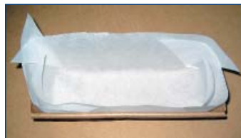
Place in tray