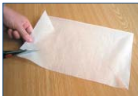
Cut the four corners