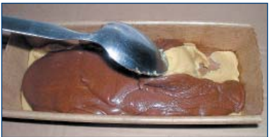
Flip the caramel on to the top